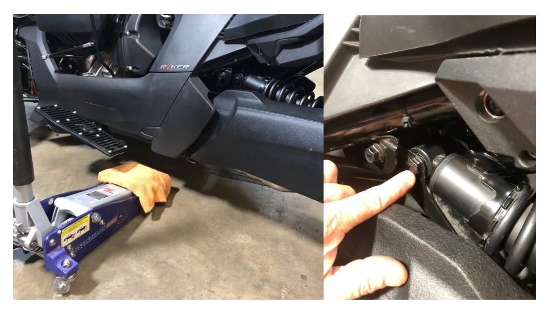
2.- Jack up the Ryker so the bolt can be removed. You will see it frees its position once being lifted so the bolt can be removed. Once the bolt is removed continue to jack up until rear wheel is off the ground.

1.- First Lift the Ryker with portable Jack. Loosen the upper shock bolt.