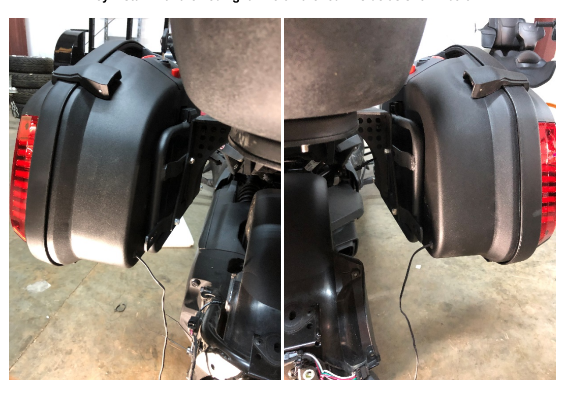
7.- Now run the wiring harness up the back of the Max Mount along the new rear trunk mount. The wiring harness main cable will stop at the trunk mount location under the Max Mount. Make sure it is free of being snagged. To help hold the new harness, the supplied wire clamps you installed on the front bolts that mounts the rear trunk mount to the Max Mount and the rear bolts towards the rear of the Ryker that mount the saddle bags brackets provide a place to secure the harness. The wire clamps mounted below provide a support for the wiring harness left & right-side for the saddle bags & rear trunk LED Lights. Plug in each saddle bag to the wiring harness connector. Secure wires to center of gussets each side with wire ties provided. Make sure to keep each main harness for the left side on the left and the right side on the right.

6.- Once the rear trunk and saddle bag mounts are positioned take each saddle bag and install it. They install with the Led light wire on the rear inside as shown below.