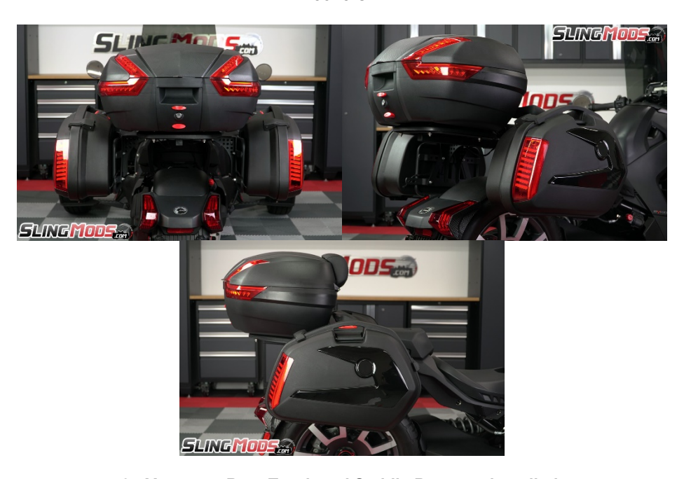
9.- Your new Rear Trunk and Saddle Bags are installed.

With wire ties provided, tie up loose ends by placing any excess. Reassemble in reverse all panels and rear light covers.